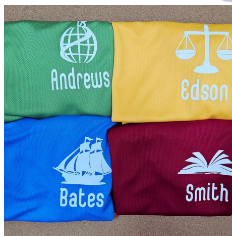
New PE/Sport Jerseys with House names