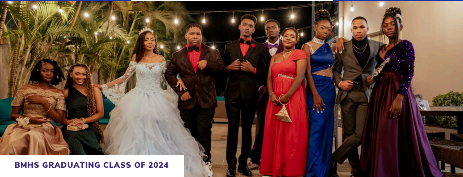
BMHS GRADUATING CLASS OF 2024