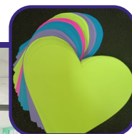
Students display their "Positivity Hearts" during Chapel