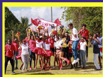
Ruby celebrates after their win