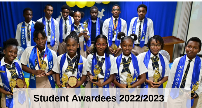
Student Awardees 2022/2023