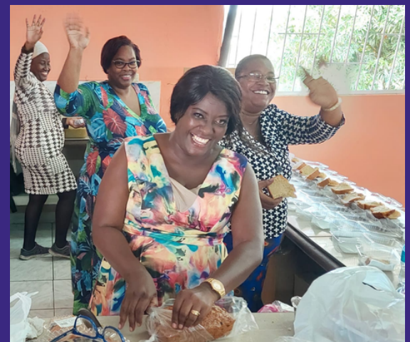
BMHS Parents assisting with the 75th anniversary celebrations