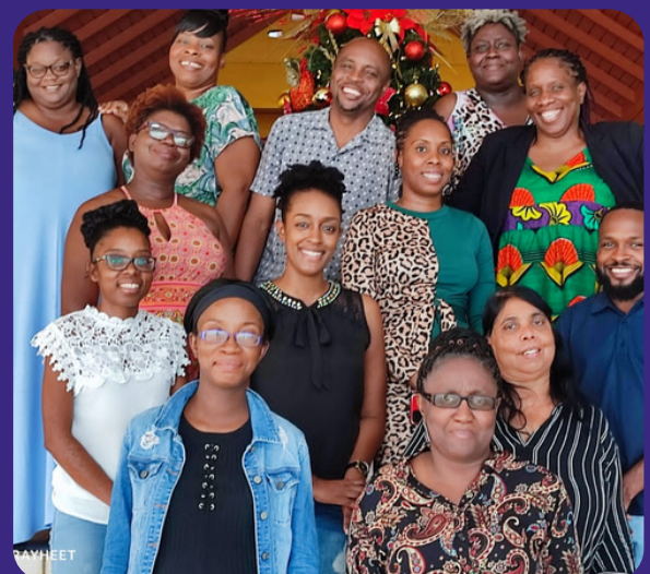
BMHS Staff's Christmas Brunch 2023