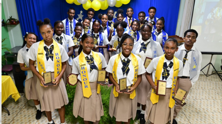
Honor Students for the school year 2022/2023